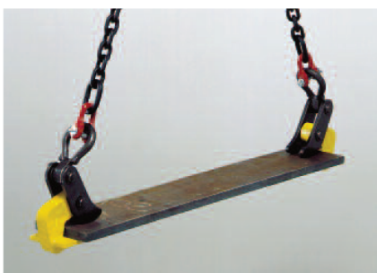
*Chain slings NOT included.

**Weight per pair of clamps without chains.